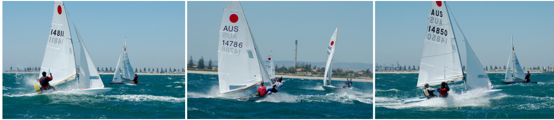
Figure 9: Photos by Peter Muirhead