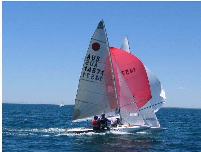
Figure 7: Photo by Peter Muirhead