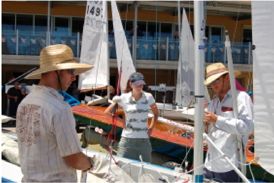
Figure 6: Comparing boat setup. Nationals 08