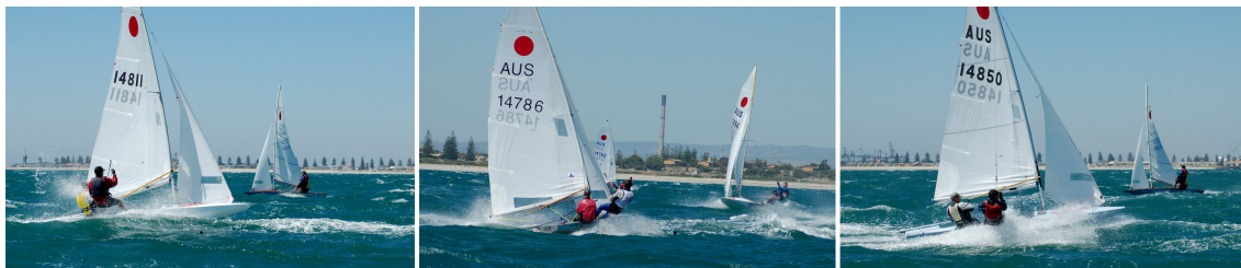
Figure 10: Photos by Peter Muirhead