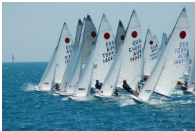
Figure 5: Powering up to the top mark