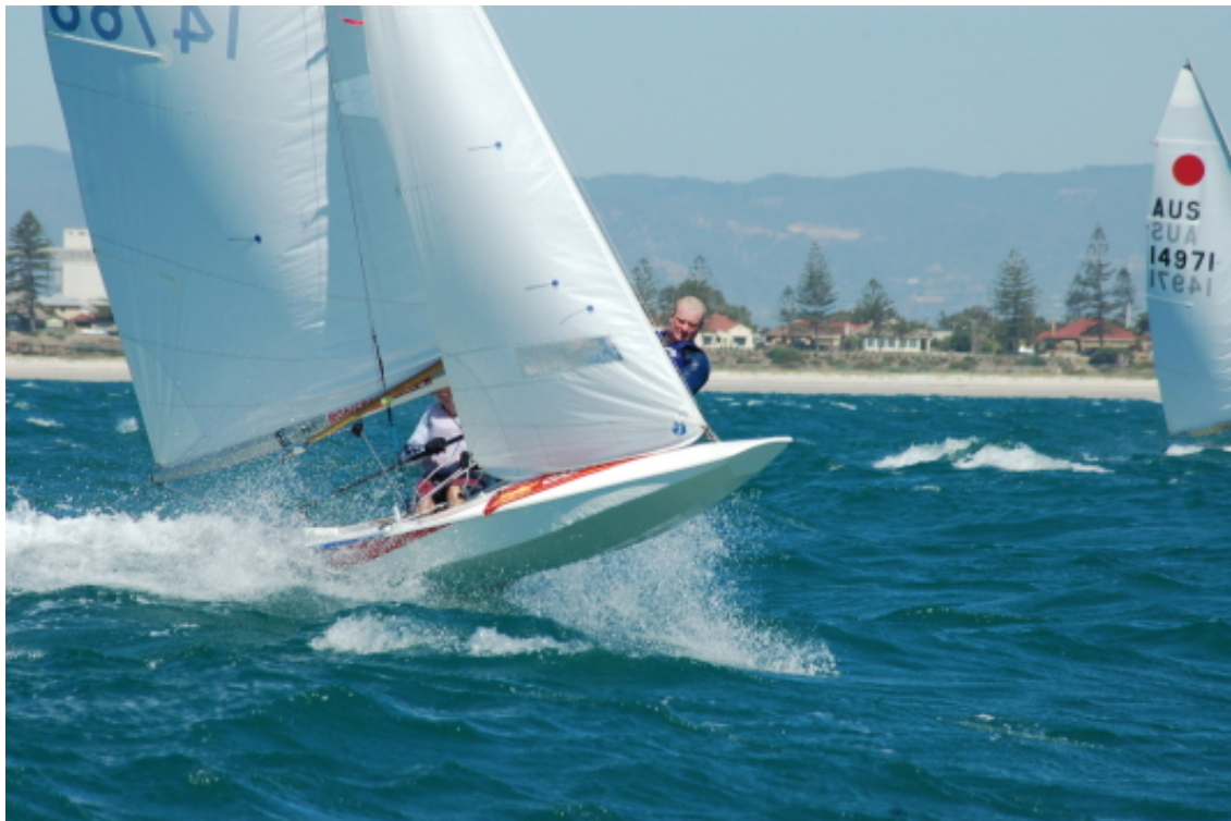
Figure 2: Fireballs leap to windward Nationals 08